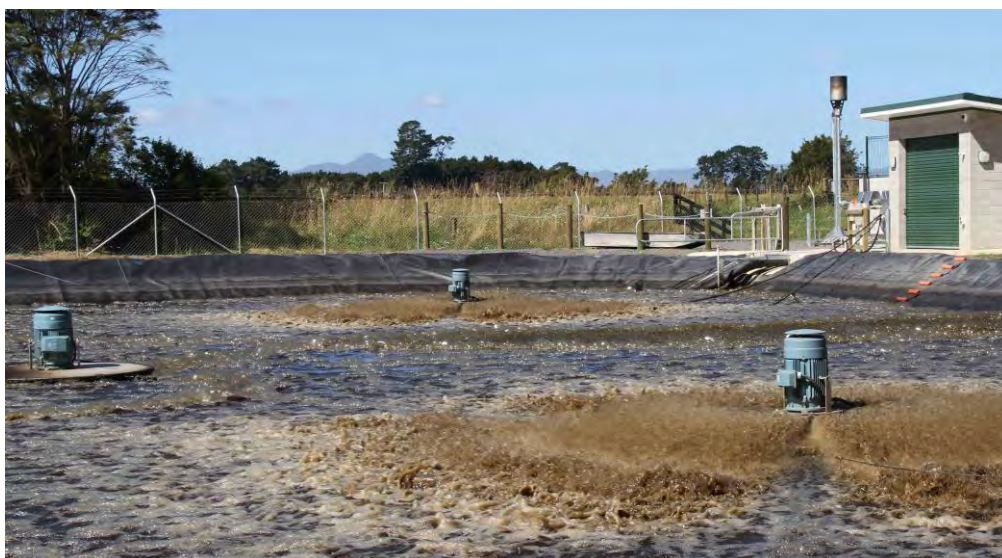
Photograph 2: SBR Plant in Aeration Phase

Photo 2 shows the SBR in AERATE phase with the control room and the biogas flare unit in the background.