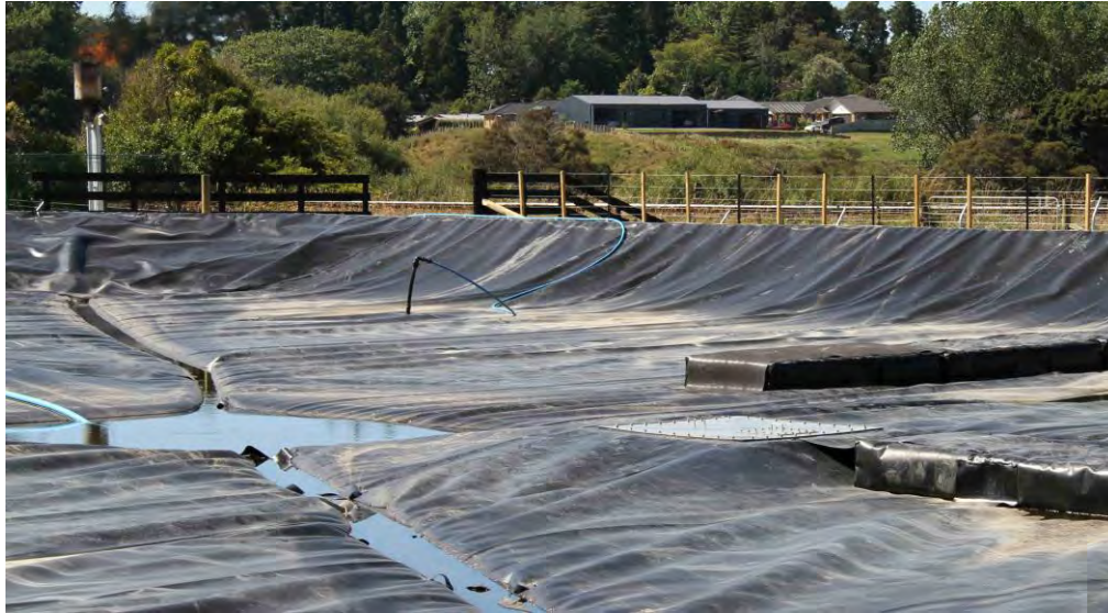
Photograph 1: Part of Covered Anaerobic Plant with Biogas Flare in Operation

The SBR was designed with a combined FILL/AERATE cycle of 6 hours, with FILL stopping once a set volume was transferred from the covered anaerobic lagoon. The aeration is controlled either by dissolved oxygen (DO) management or pH management. Following the aeration, a SETTLE phase of 1 hour is provided, with a DECANT cycle of around 5 hours. The aeration requirement is based on managing the BNR process, with 66 kW of mechanical aeration capacity installed (additional provision of 22 kW provided for future). The SBR operates on a two 12-hour cycle per day regime with volume controls as being the primary controller and level controls as the secondary control. When the aeration demand is reduced, then a dedicated mixer starts automatically to ensure that the SBR mixed liquor remains in suspension.