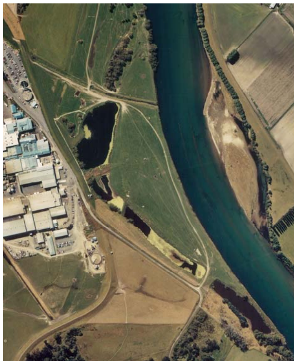
Photograph 1: Silver Fern Farms Finegand discharge showing two distinct discharge plumes

The discharge from Silver Fern Farms Finegand plant created two distinct plumes at the point of discharge in the Clutha River/Mata-Au that was visible for an extended length of the river until the plumes dissipated into the river body (see Photograph 1, dated 4 March 2005).