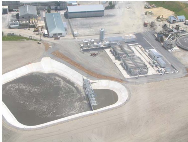
Photograph 2: Overall layout of the Finegand Upgraded Wastewater Treatment Plant

chemical facilities, UV disinfection units and control room. The processing plant facilities are shown on the top left of the photograph.